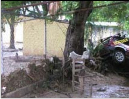
Fence surrounding Jimaní's Hospital