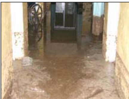
Main hall at the emergency department of Jimaní's Hospital

In Jimaní, the municipality most affected to date, the Melenciano General Hospital was flooded, equipment was damaged and there was a substantial loss of medical supplies. Patients had to be transferred to La Fortaleza.