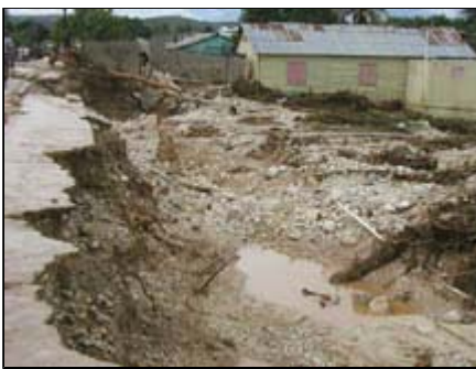
Jimaní's main street

Santo Domingo, the capital of the Dominican Republic, has been severely affected. The Dominican Republic National Emergency Commission has declared a red alert in the region around Jimaní, the capital of the province of Independencia, and a yellow alert for the rest of the country.