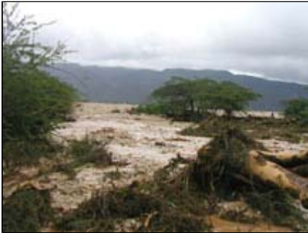
Soley river bed

(vectors), population displacement and deterioration in drinking water and basic sanitation systems and health infrastructure.