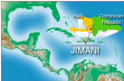
Map of the affected area

Background - Health Situation - Province of Independencia - Health Services Network - Summary of Health Situation in Haiti - Analysis of Resources and Needs - Haiti Photo Gallery