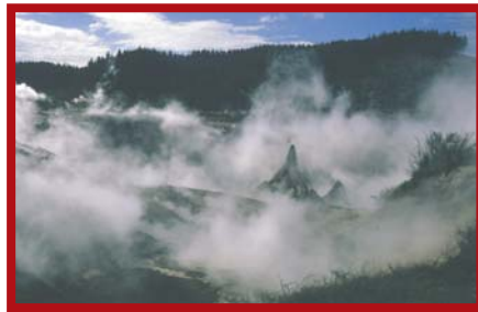
Fig 8. Fumarole activity