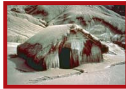
Fig 4. Ash damage

Tephra is the term used to describe all volcanic debris expelled into the atmosphere from a volcano. The fine fraction is known as ash, which is formed either by explosions or when lava domes disintegrate into pyroclastic flows. Ash fall accumulating on structures can add sufficient weight - especially when wet - to cause collapse. Ash mixes easily with water to form mud, making surface travel difficult and providing the source material for lahars (see page 9). Ash may stay in the atmosphere for months, causing long term health problems. In large quantities, it can also contaminate water supplies, destroy crops and, if ingested, kill grazing animals.