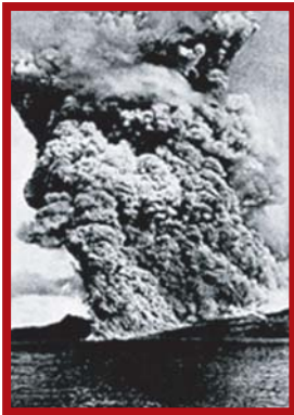
Fig 3. Pyroclastic flow - St. Pierre 1902