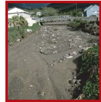
Fig 6. Lahar deposits (Montserrat)

• They may be hot or cold, according to the proportion of hot volcanic material they contain.