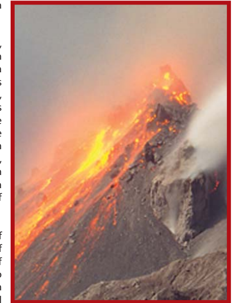
Fig 2. Soufriere Hills lava dome