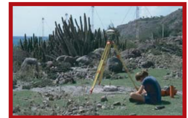
Fig 9. GPS monitoring (Montserrat)

• Synthetic Aperture Radar (SAR) reveals patterns of surface deformation by comparing sequences of aerial or satellite radar images of the volcano.