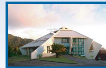
Fig 11. Guadeloupe Volcano Observatory

Reports will be issued more frequently during sustained increases in activity.