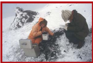
Fig 10. Microgravity monitoring

The movement of magma below and into a volcano changes the distribution of mass and density beneath the surface, which in turn modifies the local pull of gravity. The magnitude of the change is tiny - a few tens of millionths of the average strength of the Earth's gravity - and can only be detected by very sensitive instruments called gravimeters or gravity meters . The local pull of gravity is also affected by ground swelling, so to be meaningful gravity measurements must be combined with techniques capable of accurately measuring surface deformation.