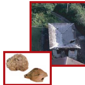
Fig 5. Volcanic bombs & associated damage