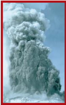
Fig 7. Phreatic explosion

Phreatic eruptions are violent explosions triggered by steam. The steam is produced as rising magma heats groundwater already in the volcano. The explosions blast out fragments of cold, old rock, which may travel several kilometers and may also generate cold pyroclastic surges. Phreatic eruptions commonly occur in the period shortly before new magma breaches the surface, but may also occur at later stages in the eruptive cycle.