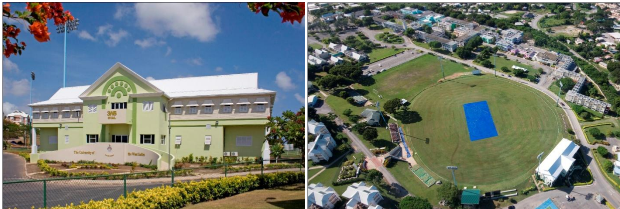
The 3WS Oval at UWI, Cave, home of the West Indies Cricket Academy

The St. Augustine Campus in Trinidad has established a Sports and Physical Education Centre which focuses on developing and delivering state-of-the-art academic programmes in physical education, coaching, training, fitness, nutrition and wellness. This ensures a sustained supply of trained physical education teachers/expertise to prepare future athletes.